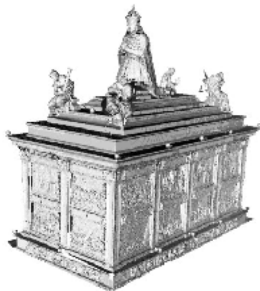
Fig. 4: Coarse resolution model (shaded view of point cloud)