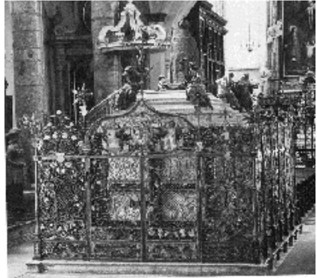
Fig. 2: Total view of the cenotaph - behind lattices – before the restoration work

The setting of tasks was not clearly defined – as is often the case in comparable projects, and had to be developed in cooperation with the responsible authorities. It stood firmly that the rare chance of accessibility from all sides should be used for documentation by all means. Of course, neither detailed plans nor art-historical documentations of this tomb were available at this time. Because of the preciousness of the object - and the uniqueness of the opportunity for data collection - accordingly a combination of geodetic measuring methods was suggested and carried out in May 2002.