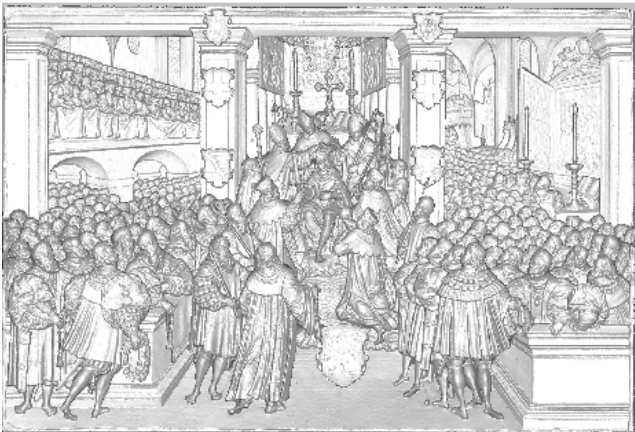
Fig. 6: Shaded view from high resolution scanning data. Screenshot, scale about 1:5.