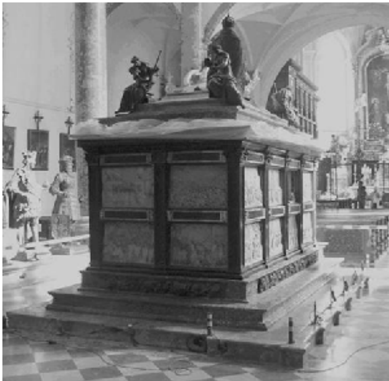
Fig. 1: Total view of the cenotaph during the measurement work – for the first time ever without lattices and glass plates