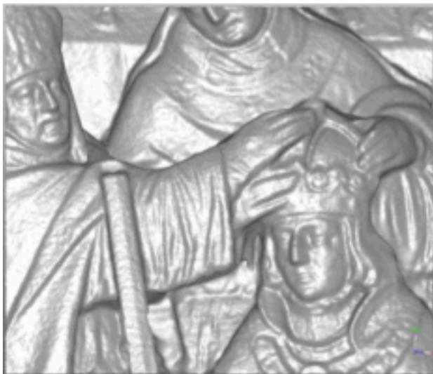
Fig. 7: Detail of figure 6. Scale about 1:1

Because of the processing limitations caused by the hard- and software which have been mentioned above, the 3D model of the whole cenotaph structure will remain relatively coarse as compared to the relief models. The 2 mm sampling as well as the poorer accuracy of the 3D points result in a good geometric model for the whole structure; detail resolution and neighborhood accuracy are not satisfactory, however. The procedures to be carried out are much the same as described for the high resolution model (section 4.1). A combination of all scanned and meshed information is not possible presently. There is little doubt that this can be accomplished in the near future.