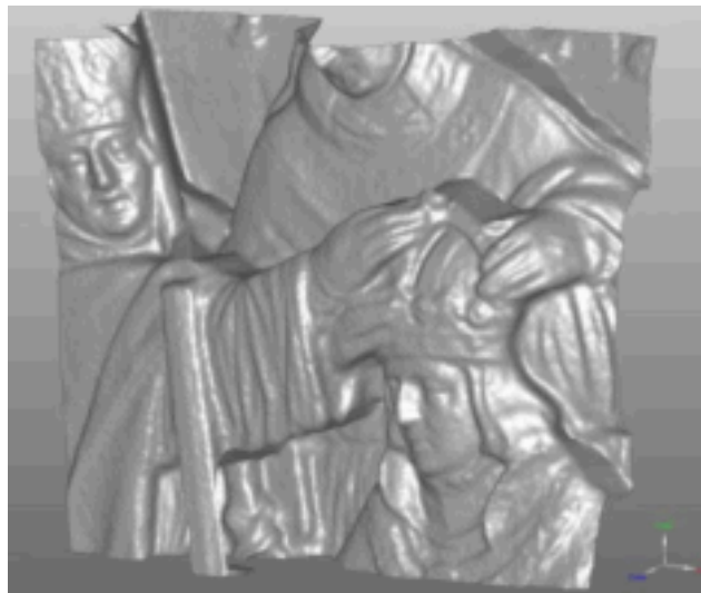
Fig. 8: Same detail as in figure 7, but seen from different angle.

We want to thank Westcam Datentechnik GmbH for the fruitful cooperation during the measurement process. Linsinger Vermessung, a private surveying company specializing in cultural heritage documentation, did an excellent job performing the photogrammetric documentation of the monument. Our acknowledgement refers – last not least – to the local authorities of Tyrol (Land Tirol, Landesbaudirektion) for the financial support and the continuous assistance solving the administrative problems.