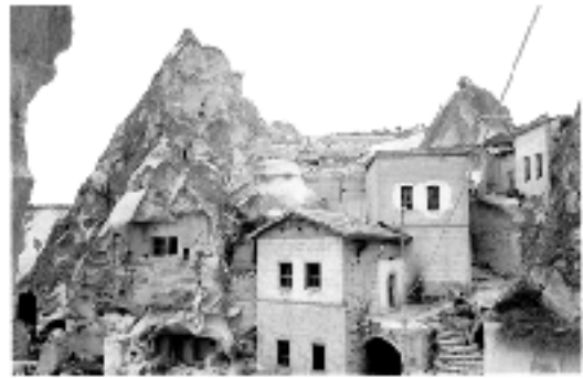
Example of a vernacular cave-dwelling site in change. Göreme, 1990