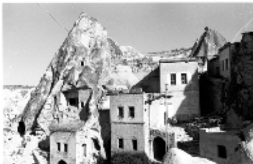
Example of a vernacular cave-dwelling site in change. Göreme, 1984

As the author also documented the area of Cappadocia in visual ways for twenty years, he built up a negative-archive on clear defined objects within the village of Göreme and surrounding areas. The rapid changes of housing and building style became obvious by comparing photographs from the same positions, but from different time periods. With the use of computers, scanners and digital cameras, a visual database had been created to be able to search for specific headwords. The aim is to extend this visual database and even cross contact with other archives of regional photography in the future.