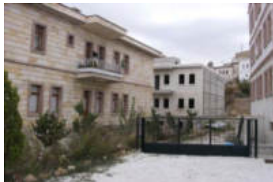
Contemporary building in Göreme