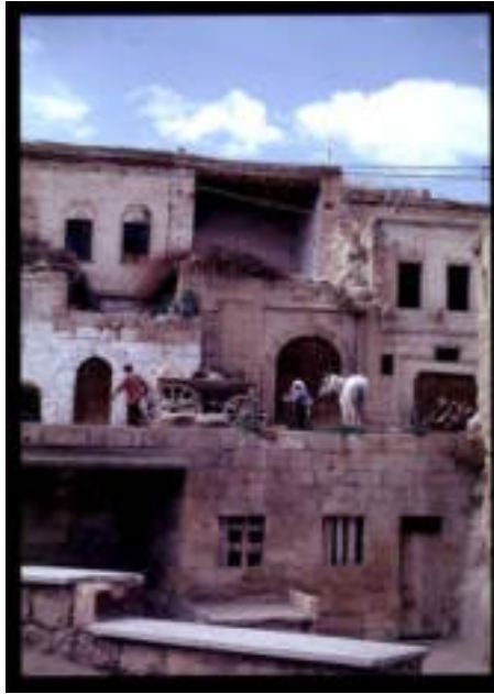
Street scene in the old part of the town, Göreme

will provide readers with basic information on the work, which has been done until recently, and the planned further steps towards a multiple approach for continuous monitoring of the local changes and the development of preventive maintenance programs.