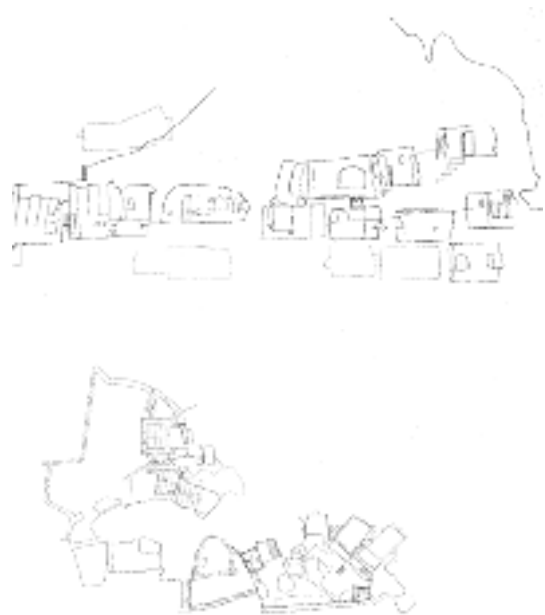
Documentation of the Cappadocia Academy site in the village of Göreme

The spatial base of the Cappadocia Academy is the private property of the author, who bought an old traditional Cappadocian house ruin with several added cave-rooms in 1998. The property, which consists of almost 20 rooms of different character, has been restored in an organic and traditional way and also in respect to modern needs and function. After cleaning the decayed site of rubble, a detailed documentation of the architectural relicts had been worked out by a group of architects and students from the Technical University of Berlin, using traditional classical methods of architectural measuring and photography to prepare ground plans and sections of the building and the added cave-rooms.