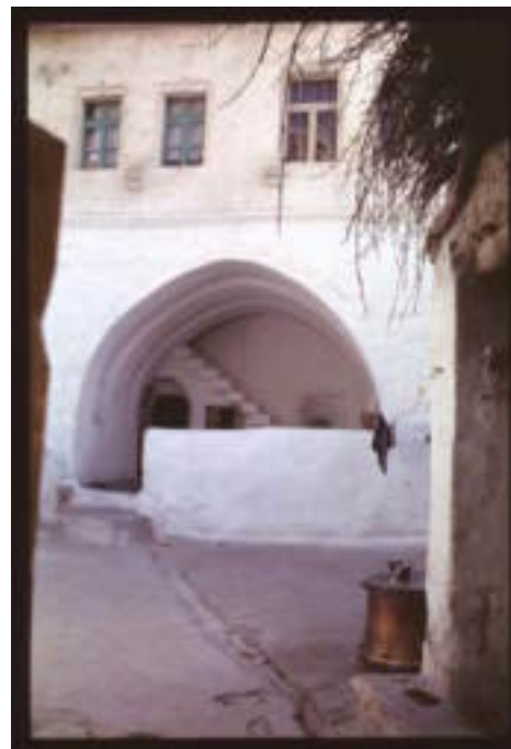
Central courtyard and traditional Cappadocian "kemer" house in Göreme

Till now activities by UNESCO concentrated mostly on the restoration of Byzantine churches and the protection of the art history of the region. Regional laws like the ban of future cave carving have been introduced. So the vernacular tradition of creating cave houses officially stopped. Today most of the new regional construction is happening in a way, which is by no means a proper answer to the ideas behind the claim of a World Heritage Site. More and more traditional houses are getting destroyed or sometimes redesigned in an often kitschy way.