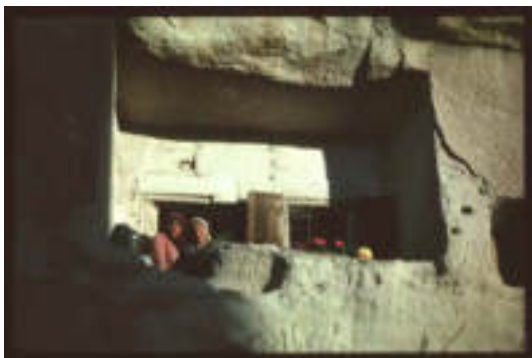
Vernacular cave dwelling in Göreme, Cappadocia

Die seit 1985 zum UNESCO Weltkulturerbe zählende Region Göreme-Kappadokien in Zentralanatolien erfährt seit etwa zwanzig Jahren einen rapiden Wandel, der vor allem durch den stark ansteigenden Tourismus in der Region, sowie durch allgemeine Modernisierungstendenzen begründet ist. Das Ziel der Cappadocia Academy ist es, ein unabhängiges und überregionales Instrument zu schaffen, um die rasanten Entwicklungen in der Region in vielfältiger Form dokumentieren zu können und um gegebenenfalls Expertisen und Ratschläge zur Lösung bestimmter regionaler Probleme hinsichtlich einer nachhaltigen Entwicklung der Region bieten zu können. In diesem Zusammenhang wurde auch das internationale und interdisziplinäre Expertennetzwerk “ platform_c ” ins Leben gerufen, welches sich mit verschiedenen Aspekten der kappadokischen Entwicklung beschäftigt und seit dem Jahr 2000 konkrete Pilotprojekte durchführt. Die Cappadocia Academy arbeitet ferner an dem Aufbau einer visuellen und ethnographischen Datenbank, professionellen CD-Rom Projekten und einer eigenen Webseite, die u.a. dem Kappadokien Interessierten gut fundierte Informationen über die Region bereitstellt. Ein längerfristiges Ziel ist die verstärkte Vernetzung mit anderen Spezialisten und Institutionen sowie die Nutzung neuer Technologien, um z.B. spezifische architektonisch bedeutsame Objekte aus verschiedenen Zeitepochen möglichst auch in 3-D Form dokumentieren zu können.