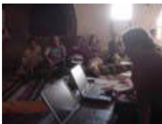
platform_c 2002 multimedia presentation in an old Byzantine cave room

Ideas for the future rank from establishing an independent non-profit charity organization in Cappadocia or a foundation towards a private profit oriented consultant agency for monitoring, restoring and spatial development in Cappadocia. The actual work of the academy is dependant on free volunteering work of international students. But there is an urgent need to recruit finance sources in order to continue and develop projects related to the topic of the World Heritage Site of Göreme-Cappadocia in the future. The Cappadocia Academy is inviting all experts in Turkey and from other countries related to this field to advise help of any kind so we can establish an independent and official organisation and Site Commission to help saving and monitoring the Cultural Heritage of Göreme-Cappadocia.