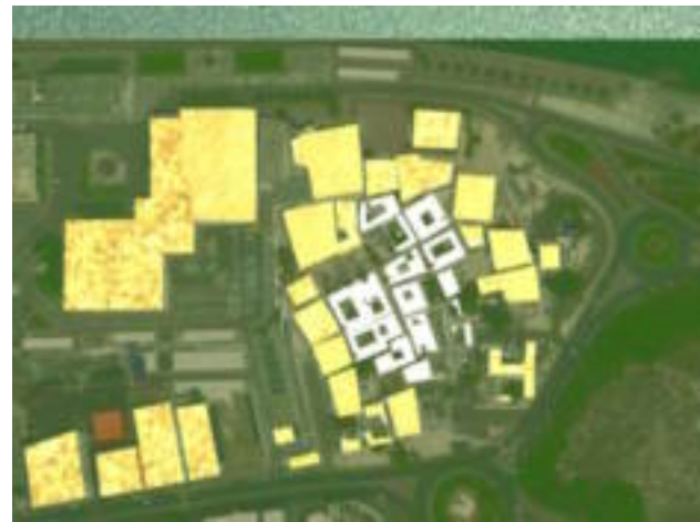
Fig. 4: A Plan view of Al Bastakia 3D Model.

The texture application was difficult due to two reasons: a) the fact that buildings are very close to each other, and b) most buildings are undergoing restoration, and as a result there are a lots of scaffoldings erected. These factors complicated the recording of orthophotos for photogrammetric analysis and production of building textures.