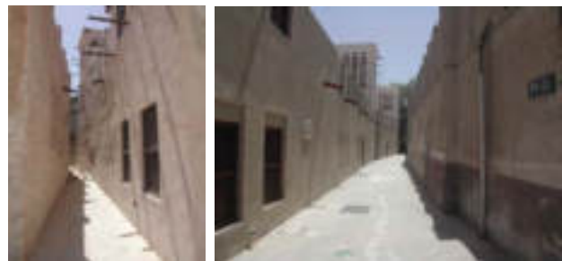
Fig. 3: Views of pathways in Al Bastakia area.