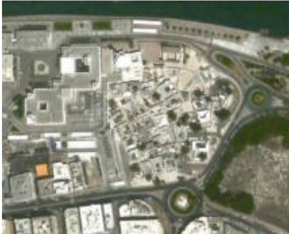
Fig. 1: A satellite image showing Al Bastakia area, 2002.